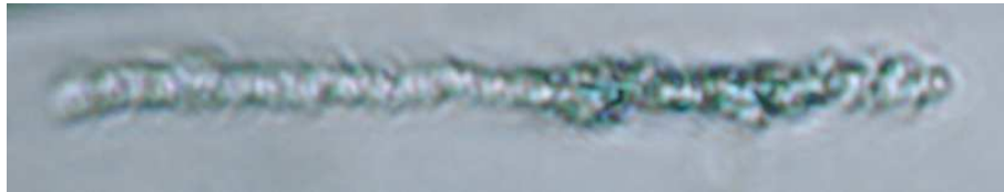
Fig. 1. The self assembled bead chain in a linear magnetic trap. The bead diameter is 800nm.

The magnetization of each magnet was directed in-plane, and normal to the slit between the magnets. As a result, the magnetic field has minimum values along a line between the magnets. Once inside the magnetic field region, beads are forced to move into the low field regions by the magnetic energy density gradient. There are two such regions: inside the solution in the magnetic trap and on the outside at the droplet surface.